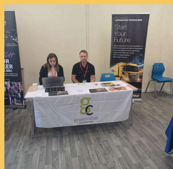
Careers Fair Fun and Learning